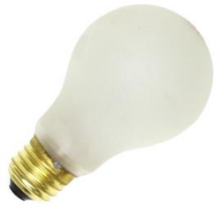
75A/RS Eiko 75 Amp Rough Service Bulb 2 pack