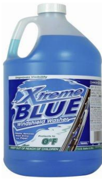
31917 Camco 0 Degree Windshield Wash Fluid 1 gallon