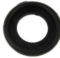
097-119 M12 Rubber Gasket 097-146 M14 Rubber Gasket