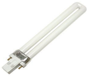
DT13/41 Eiko 4100k Duo Tube Fluorescent Service Bulb