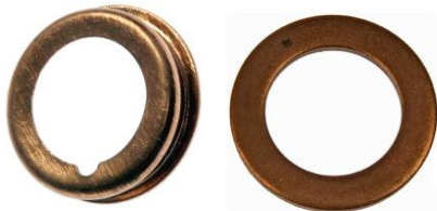
097-134 M12 Copper Crush Gasket 095-019 9/16" M14 Copper Gasket