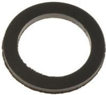
097-016 M12 Fiber Gasket 097-026 9/16" M14 Fiber Gasket 097-018 M18 Fiber Gasket