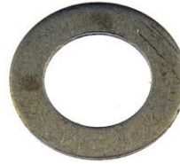
095-143 M12 Aluminum Gasket 095-015 9/16" M14 Aluminum Gasket 095-149 M18 Aluminum Gasket