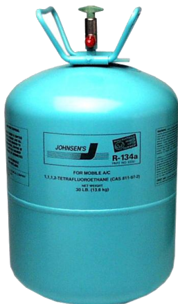
6330 R-134a Refrigerant 30lb Cylinder* *Brand subject to change