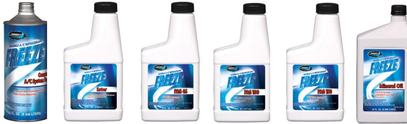
6545-6 Johnsen's Air Conditioning Flush 32 oz bottle 6808-6 Johnsen's Ester Oil 8 oz bottle 6812-6 Johnsen's PAG 46 Oil 8 oz bottle 6816-6 Johnsen's PAG 100 Oil 8 oz bottle 6822-6 Johnsen's PAG 150 Oil 8 oz bottle 6912-6 Johnsen's Mineral Oil 8 oz bottle