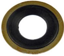
097-021 1/2" M12 Metal Rubber Gasket 097-025 9/16" M14 Metal/Rubber Gasket 097-028 M18 Metal Rubber Gasket 097-133 M20 Metal Rubber Gasket