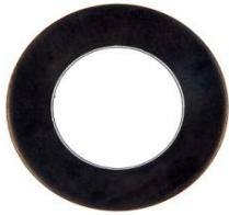
095-156 M12 Aluminum Rubber Coated Gasket