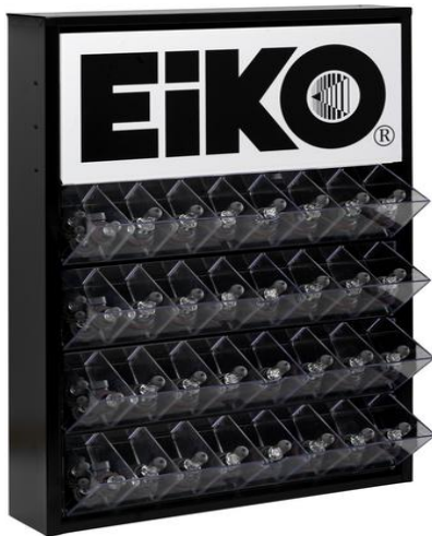
44250 Eiko Light Bulb Cabinet