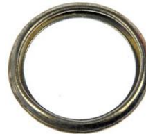
095-142 M20 Steel Crush Gasket