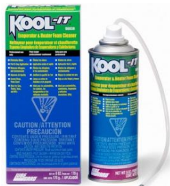
96030 LubeGard Kool It Evaporator & Heater Foam Cleaner 6 oz aerosol